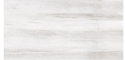
GINE2448BI 24" x 48" Rectified Field Tile