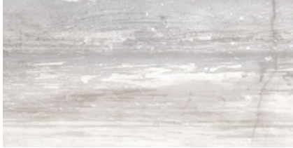
GINE2448AR 24" x 48" Rectified Field Tile