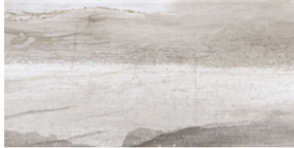
GINE2448DK 24" x 48" Rectified Field Tile