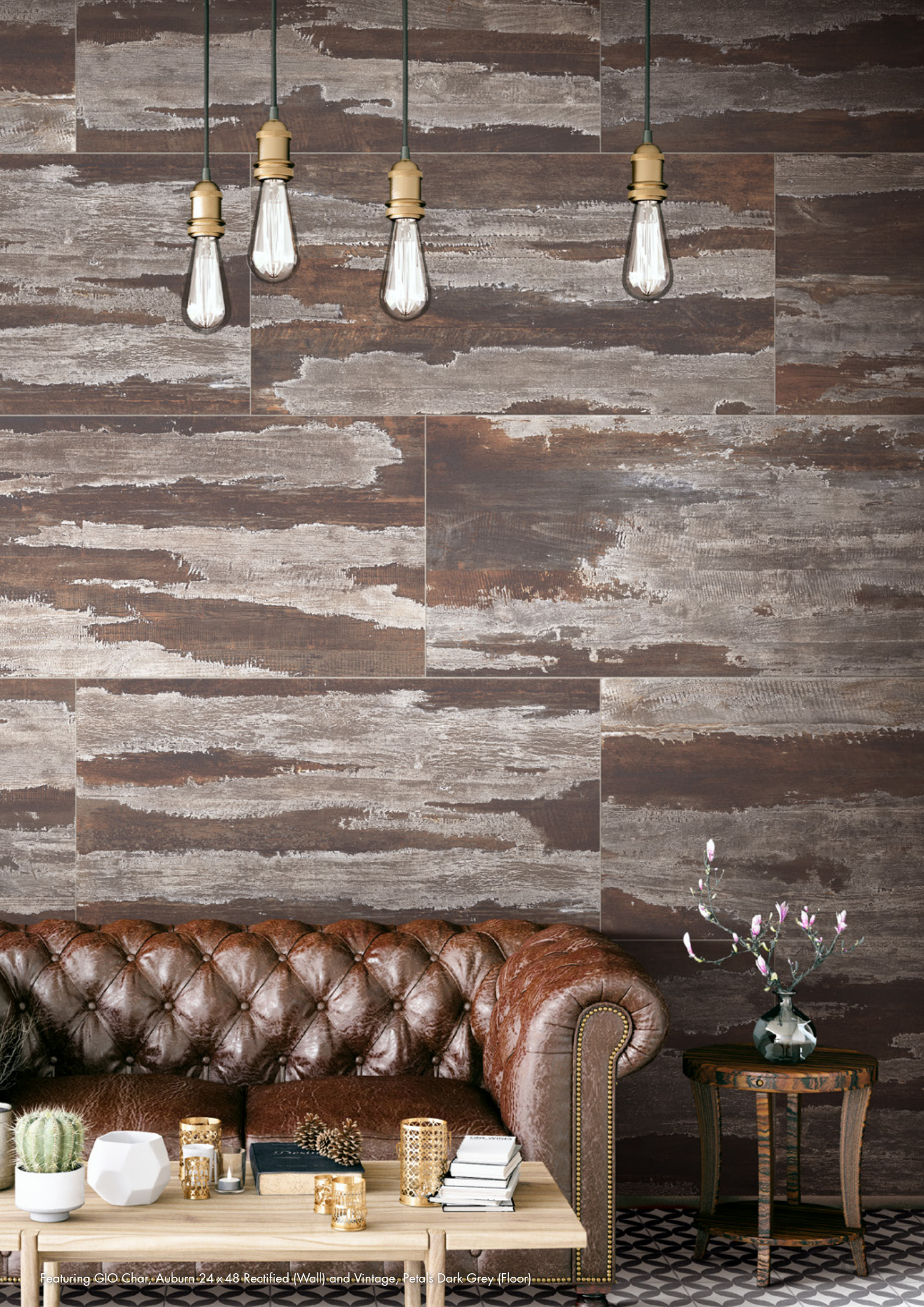
Featuring GIO Char, Auburn 24 x 48 Rectified (Wall) and Vintage, Petals Dark Grey (Floor)