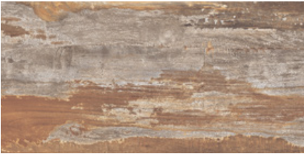
GICHR2448RU 24" x 48" Rectified Field Tile