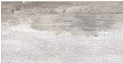
GICHR2448BI 24" x 48" Rectified Field Tile